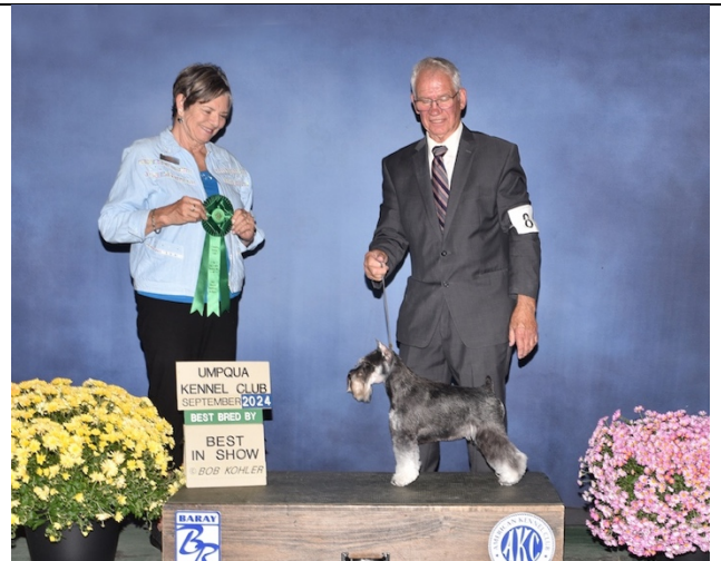
(left) Rumor's new Am. Ch. (above) Bliss's Best Bred By In Show